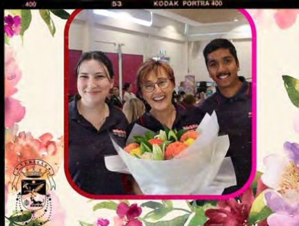
FAREWELL WATER ST KIDS