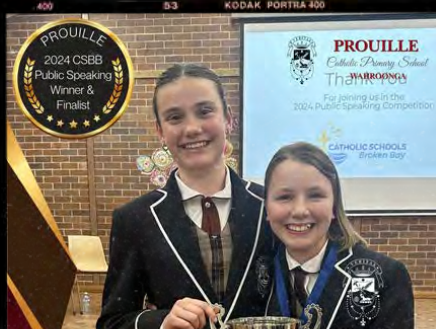
CSBB PUBLIC SPEAKING